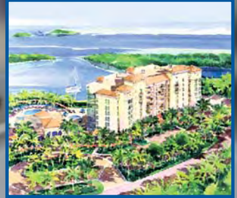
Scanned from a board 48" wide x 30" high

Big Drawings can easily be scanned into a computer for placement into your graphics for flyers, brochures, or even duplications. We can scan floor plans, renderings, and artwork up to 40 inches wide, .85 inches thick, and unlimited length.